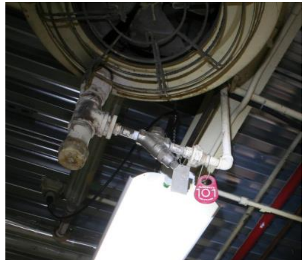
Typical Delta venturi steam trap fitted on steam system.

Michel Houde – Michel.houde@krugerproducts.ca Tel: 819-595-5314